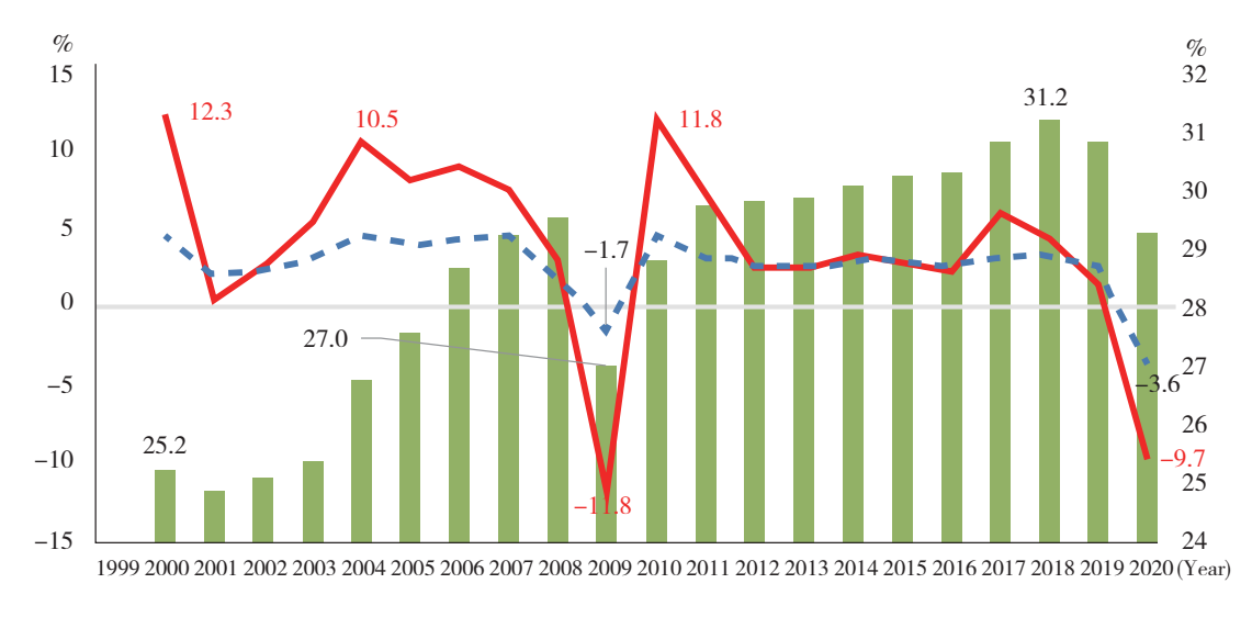
Figure 11-2 World GDP and Trade Growth (%), since 2000

A real action to promote the building of a community with a shared future for mankind. The CIIE provides a new comprehensive public platform for international cooperation, and China said other countries are welcome to take the express train and hitchhike of China's development for free. The participation of countries involved in the BRI in the CIIE has helped to deepen and solidify the joint building of the initiative. All relevant parties discuss ways of common development and problem-solving through consultations, which is conducive to guiding economic globalization towards being more open, inclusive, balanced and inclusive. While goods and serves